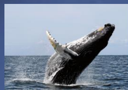
Here be whales!

Ferry Ettalong to Palm Beach Departs Ettalong AM 8.00, 9.30, 11.00 PM 12.20, 2.30, 3.30, 4.20, 5.30, 6.40