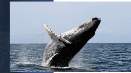
Here be whales