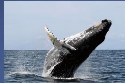
Here be whales!

Ferry Ettalong to Palm Beach Departs Ettalong AM 8.00, 9.30, 11.00 PM 12.20, 2.30, 3.30, 4.20, 5.30